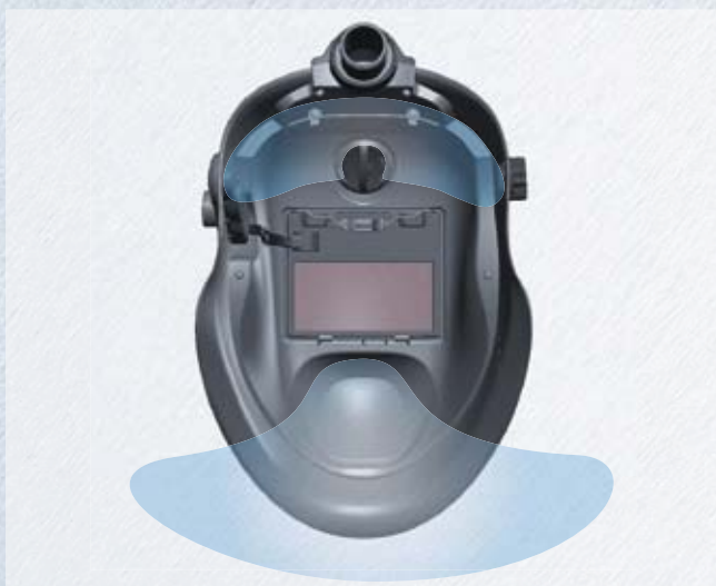
Controllable air-flow for the mouth and forehead zones.

Finally, the new generation of “Air” models also have a longer protective hose with an improved fastening scheme that gives users even greater freedom of movement.