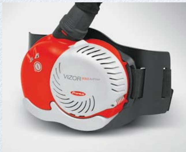
The Vizor 3000 AirFilter fan-filter unit protects the user from particles, welding fumes and dust.